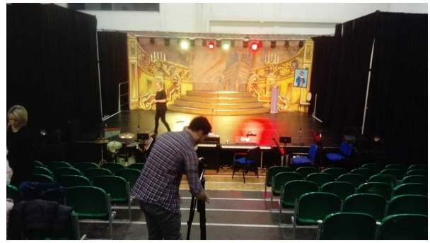
All lit up and ready for the audience