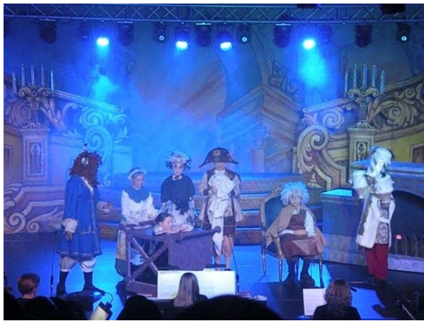
Chip, Mrs Potts and their friends