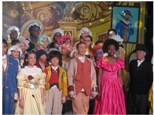
Final curtain call