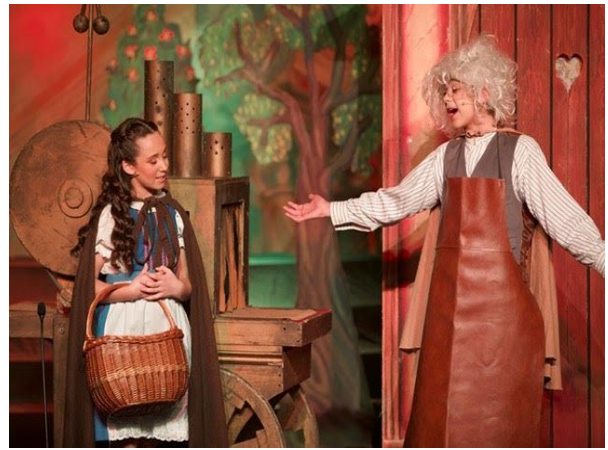
Belle and Papa