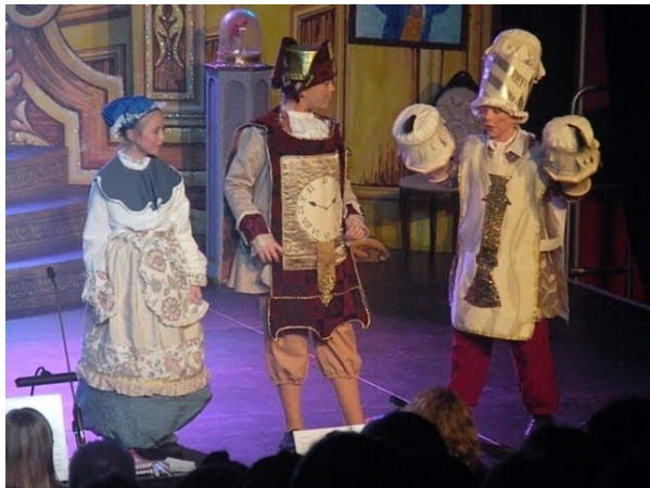
"Non, mon cherie"