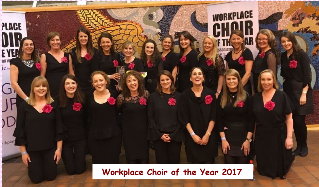
Workplace Choir of the Year 2017

Congratulations to our staff choir on being recently crowned 'Workplace Choir of the Year 2017'!