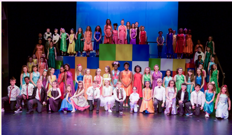
The star cast of our school musical 'Back to the 80's!' which played to sell-out audiences in Draíocht Theatre, Blanchardstown in February.

Both the slogan and logo were combined to form our 'Biodiversity Code' (above) which is on display throughout the school.