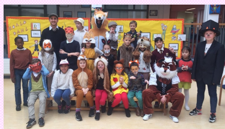
Just a few of the many children and staff members who took part in our Roald Dahl themed fancy dress